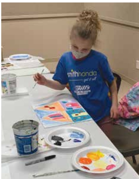
Student painting in Artistic Adventure, TAM's afterschool art class.