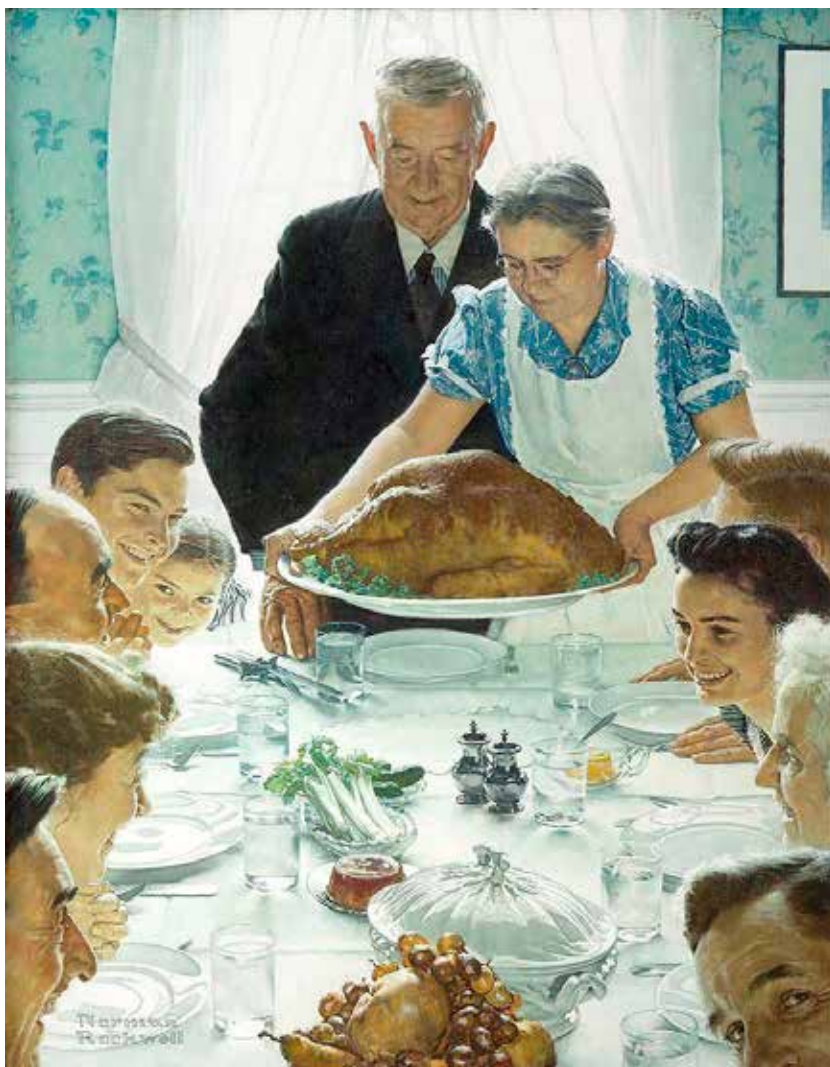
© Norman Rockwell, Freedom from Want , 1943