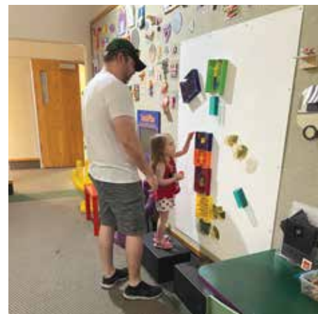
A family enjoying the newly re-opened KIDStudio.

Adult classes engage new and emerging artists, allowing beginning students to develop their own artistic voice and advance in techniques. Intermediate and advanced classes and workshops help established artists connect with new approaches and refine their skills.