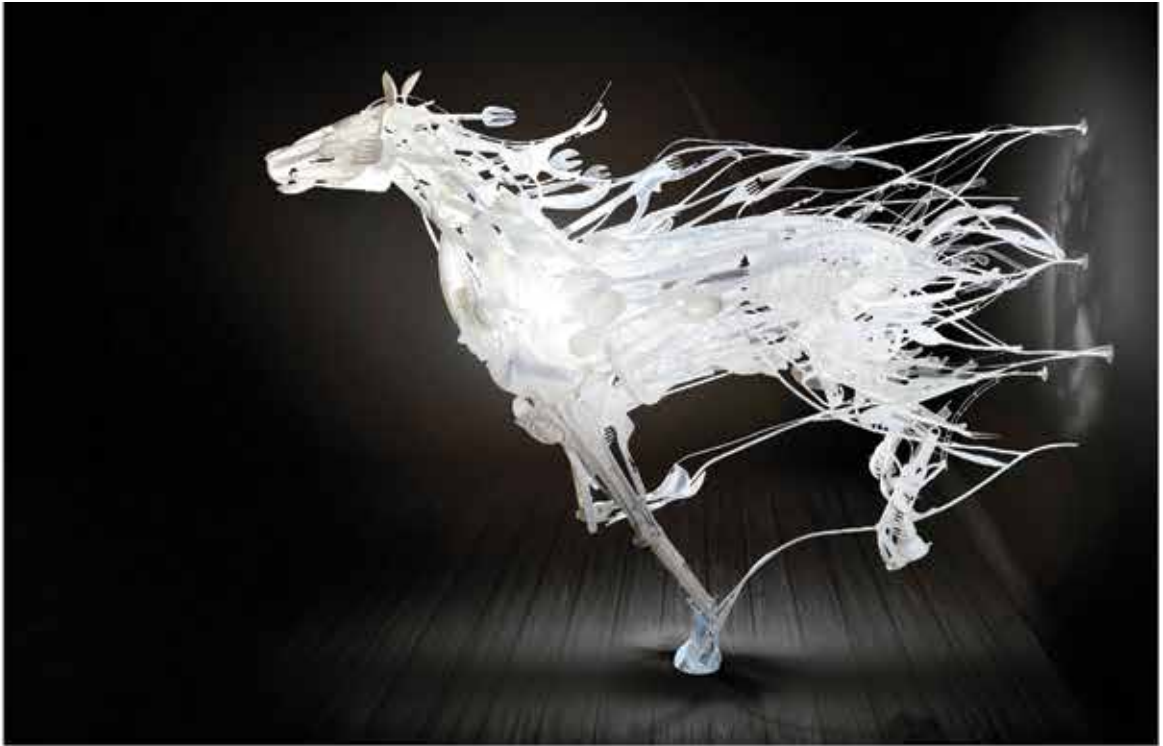
© Sayaka Ganz, Emergence (Light) , 2013.